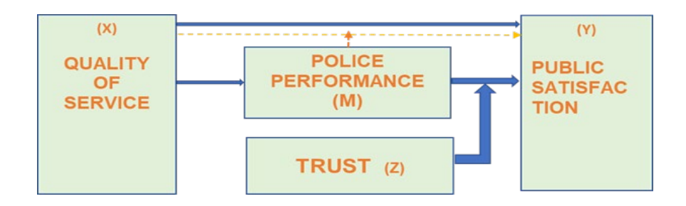
Fig. 3. Hypothesis Testing

The research framework shown in Figure 1.1 summarizes the logical flow of the research stages conducted. This figure illustrates the relationships between key variables, starting from problem identification, the formulation of research objectives, to the methodological steps employed to achieve the final results. The framework provides a comprehensive overview of the research focus and direction, as well as how each component of the study is interconnected. Through this framework, it is expected that readers will gain a clear understanding of the fundamental concepts underpinning the research and how the study has been systematically structured.